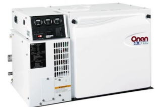
Anan Optional Sound Shield Model pictured has optional gauges